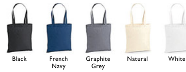
Black French Navy Graphite Grey Natural White