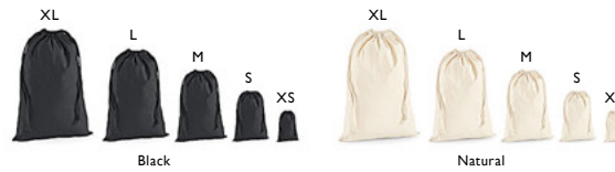
Available in 5 sizes