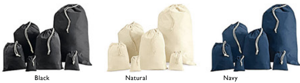
Available in 6 sizes: XXS, XS, S, M, L, XL