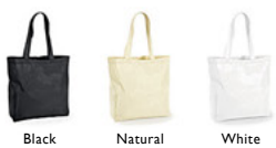
Black Natural White