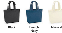
Black French Navy Natural