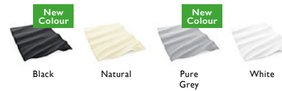
Black Natural Pure Grey White