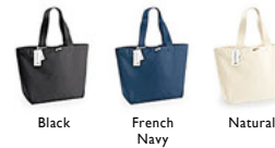
Black French Navy Natural