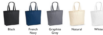
Black French Navy Graphite Grey Natural White