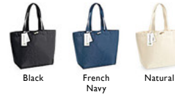
Black French Navy Natural